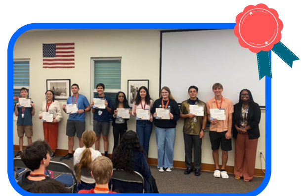
Freshmen students awarded for straight-A Principal List