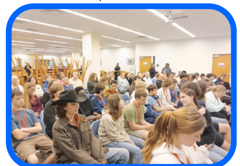
Students gather in the library for the ceremony.